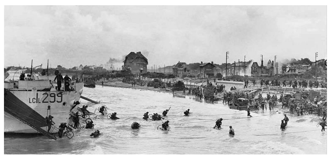
Canadian troops disembarking at Bernières, Juno Beach

Two days of sightseeing in the area of the Normandy Beaches where Allied forces landed on D-Day, June 6, 1944. We focus on the Canadian sector, Juno Beach , where we visit the towns of Bernières and Courseulles, the Juno Beach Centre, and Bény-sur-Mer Canadian War Cemetery. Other sights included will be Ardenne Abbey, with its memorial to Canadian POWs executed there by SS troops; Bretteville Canadian War Cemetery, in the area where the battle of the Falaise Gap was fought; remains of the artificial Mulberry Harbour in Arromanches; the famous Pegasus Bridge; the huge American Memorial at Omaha Beach; and the town of Bayeux, where we will view the famous Tapestry, depicting William the Conqueror's 1066 conquest of England. No group dinners scheduled for days 13 and 14.