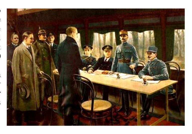
November 11, 1918: The Armistice is signed in Rethondes

Departure from Honfleur after breakfast. We motor to Rethondes , a hamlet in the Forest of Compiègne where the Armistice was signed on November 11, 1918 in the railway carriage that served as HQ of Allied Commander in Chief, Marshal Foch; it is also here that the French capitulated on June 22. (http://en.wikipedia.org/wiki/Armistice_with_Germany_ %28Compi%C3%A8gne%29). Afterwards we enjoy a gourmet Au Revoir lunch in a traditional country restaurant. Then we cross back into Belgium for our overnight in the Holiday Inn hotel near Brussels Airport.