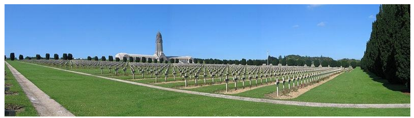
Panoramic view of Douaumont Ossuary near Verdun